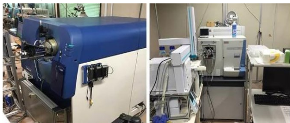
Fig.2 Hybrid Mass Spectrometers From the left: TripleTOF5600, and LTQ Orbitrap Velos Pro