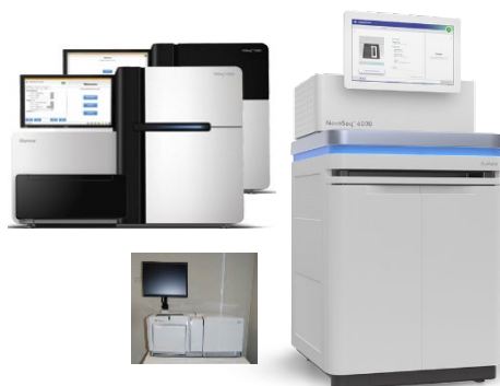
Fig.1 Next Generation Sequencers

1) DNA sequencing analysis using next generation sequencers.