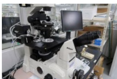
Fig. Electroporator (left) and Micromanipulator System (right)