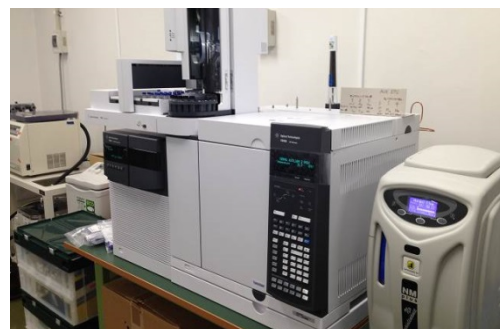
Fig. 5 GC-MS system

For metabolome analysis of low-molecular weight hydrophilic metabolites, including sugars, organic acids and amino acids