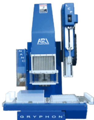
Fig. 1 Crystal Gryphon LCP Setting-up