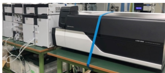
Fig. 6 SFC-MS system