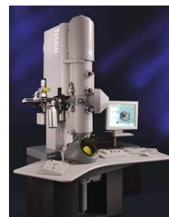
Fig. 2 Cryoelectron microscope (Tecnai Polara)