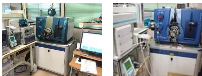
Fig.3 From the left: QTRAP6500, and QTRAP5500