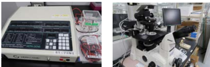
Fig. Electroporator (left) and Micromanipulator System (right)

We can provide the following technological support regarding developmental engineering experiments: ES injection into blastocysts, DNA injection (including Crispr/Cas9) into fertilized eggs, in vitro fertilization/preparation of frozen fertilized eggs, etc.