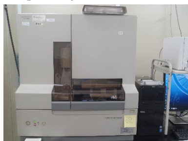
Fig.2 ABI PRISM® 3130

Sequencing and microsatellite marker DNA fragment analysis by Applied Biosystems Model 3130.