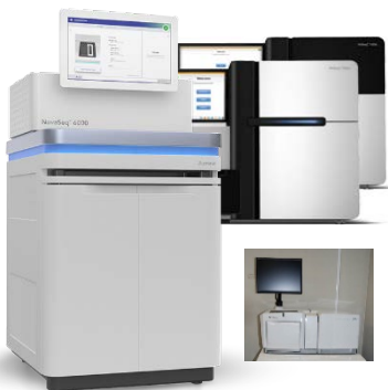
Fig.1 Next Generation Sequencers

1) DNA sequencing analysis using next generation sequencers.