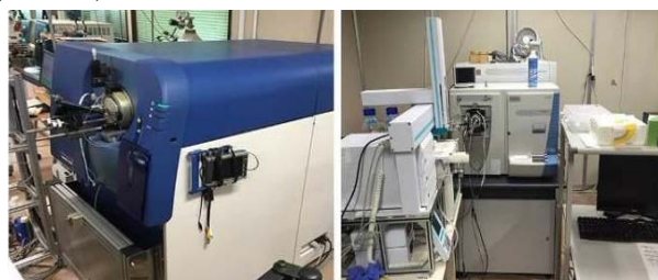
Fig.2 Hybrid Mass Spectrometers

From the left: TripleTOF5600, and LTQ Orbitrap Velos Pro