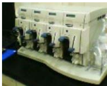
Fig.3 Affymetrix Gene Chip System

Microarray analysis by Affymetrix Gene Chip System.