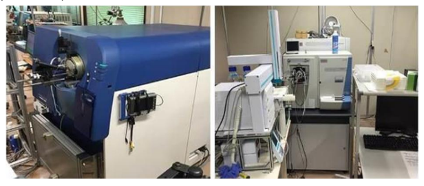
Fig.2 Hybrid Mass Spectrometers From the left: TripleTOF5600,and LTQ Orbitrap Velos Pro