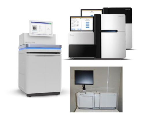
Fig.1 Next Generation Sequencers

1) DNA sequencing analysis using next generation sequencers.