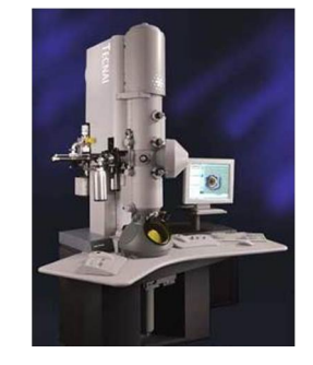
Fig. 2 Cryoelectron microscope (Tecnai Polara)

*1) The conditions or quantities of protein samples required for a successful measurement may vary substantially depending on the type of analysis or research aim. <u>Please inquire of the facilitator in the institute beforehand whether the experiment is feasible or not.</u>