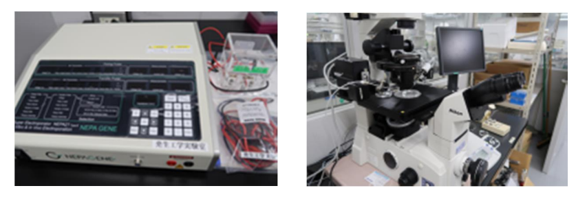
Fig. Electroporator (left) and Micromanipulator System (right)

We can provide the following technological support regarding developmental engineering experiments: ES injection into blastocysts, DNA injection (including Crispr/Cas9) into fertilized eggs, in vitro fertilization/preparation of frozen fertilized eggs, etc.