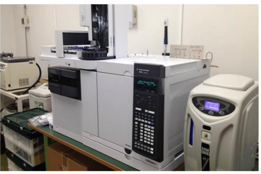
Fig. 6 GC-MS system

For metabolome analysis of low-molecular weight hydrophilic metabolites, including sugars, organic acids and amino acids