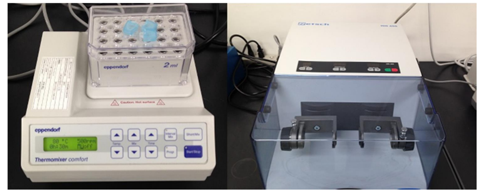
Fig. 5 Sample preparation system for metabolome analysis

Metabolomics research requires proper sample preparation system to obtain high quality metabolome data.