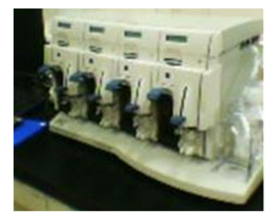
Fig.3 Affymetrix Gene Chip System

Microarray Analysis Microarray analysis by Affymetrix Gene Chip System.