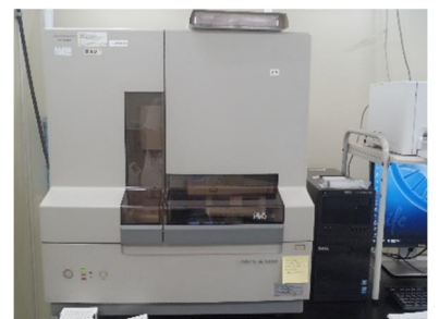
Fig.2 ABI PRISM® 3130

Sequencing and microsatellite marker DNA fragment analysis by Applied Biosystems Model 3130.